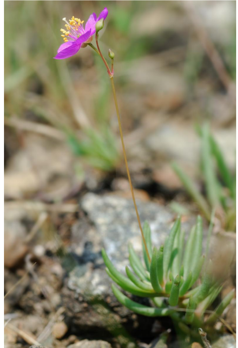
Piedmont Fame-flower (G1) Critically Imperiled